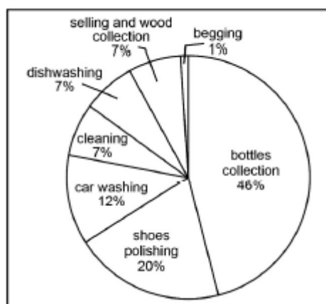
CHILD LABOUR IN INDIA

For the Visually Impaired Candidates only in lieu of Q. No. 5 (b) :