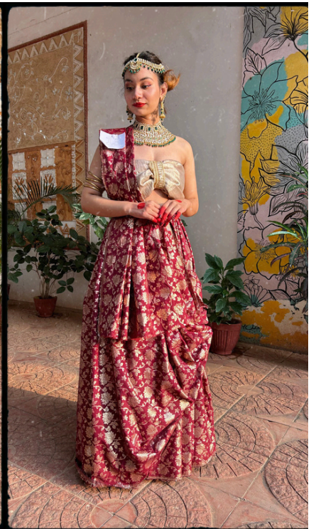
Live Model Draping – First Prize Winner of the Ethnic Day Competition