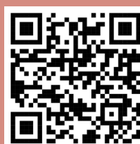
Scan for detailed Course Contents of MBA Executive

Students attend their classes in one of the two campuses of FMS (North and South Campus). The allocation of the campus is done by FMS.