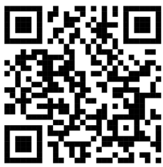
Format For NOC and EWS Category Certificate

Param Vir Chakra; Ashok Chakra; Maha Vir Chakra; Kirti Chakra; Vir Chakra; Shaurya Chakra; President's Police Medal for Gallantry; Sena, Nausena, Vayusena Medal; Mentioned - in - Dispatches; Police Medal for Gallantry