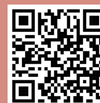
Scan for detailed Course Contents of MBA Executive (HCA)