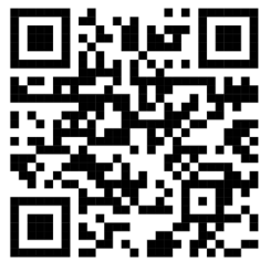
Format For CW and EWS Category Certificate