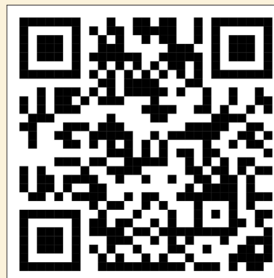
Scan for detailed Course Contents of MBA Full-Time

At FMS, the MBA course structure is closely aligned with the contemporary business requirements. The focus is on producing managers with sound fundamentals to hit the ground running when they enter the corporate world. The programme empowers students to demonstrate the ability to innovate, the ability to execute the most daunting challenges in the most trying of circumstances, the ability to create synergies amongst the most diverse set of variables and the ability to continuously learn, improvise, adapt, energize, excel and grow.