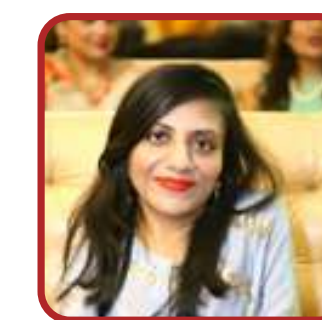
Ira Singhal IAS