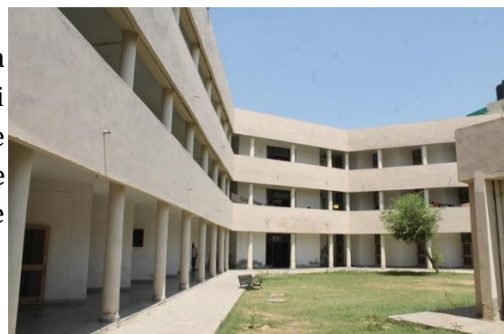
Rani Laxmi Bai Girls Hostel

The university has one Boys Hostel viz. Maharana Pratap Boys Hostel and two Girls Hostel viz Rani Laxmi Bai Girls Hostel & Bhagini Nivedita Girls Hostel. The students may apply for the hostel separately, and the Information Brochure for the same is available on the university website www.igu.ac.in .