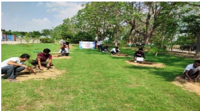
Plantation Drive in the Campus

Indira Gandhi University, Meerpur has started a drive to make the campus green, and with this objective, plants of different varieties are planted every year. More than 5000 plants of fruits, herbal and medicinal value, etc., are being planted on a regular basis.