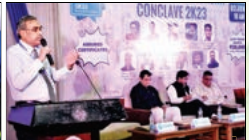
Youth Entrepreneurship conclave