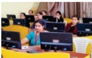
Biz Lab Faculty Training Workshop