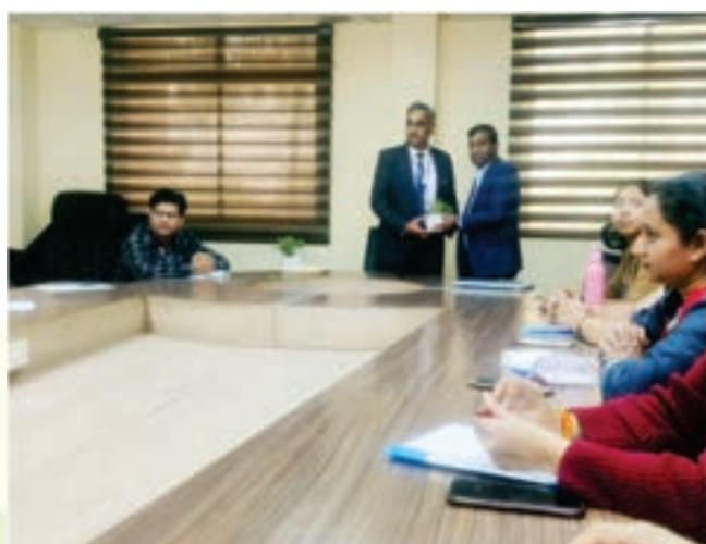
Research Methodology Paper writing workshop