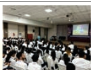
Expert Talk on Artificial Intelligence

3. Student Activity Council- It works for Student Welfare & aims at nurturing personality through extra-curricular activities and branding of the institution. The clubs working under it is UTSAV and PRAYAS. It organises various Cultural, Sports, Event Management, In-campus and Off-Campus activities for students.