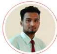
Dikhu Raj Dixit Piramal Swasthya