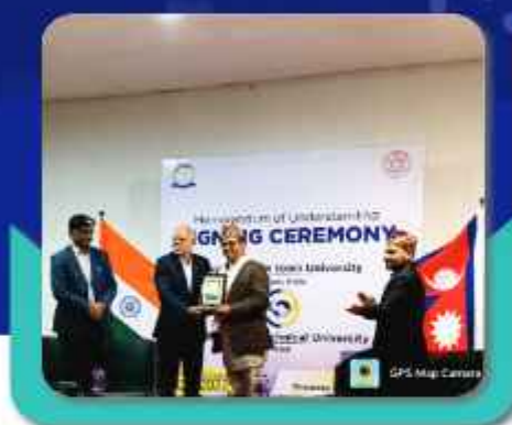
with Manmohan Technical University