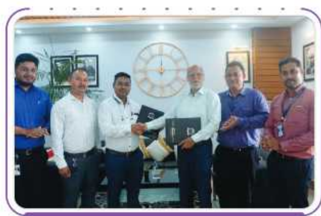
with Edulife India