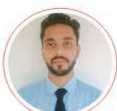
Asif Shah IntelliPaat