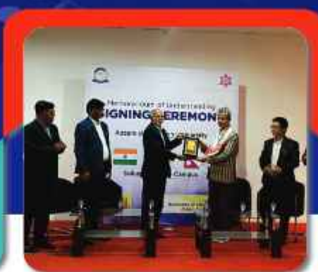
with Sukuna Multiple Campus