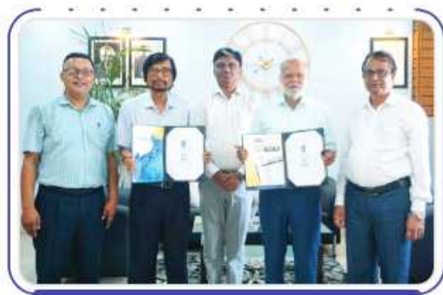
with Assam Science Society