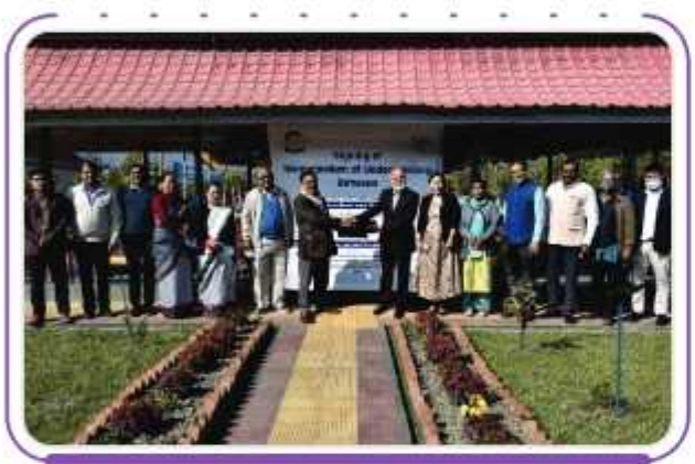
with Institute of Bioresources and Sustainable Development, Imphal