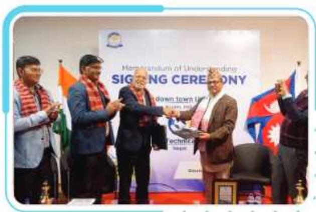
with Manmohan Technical University