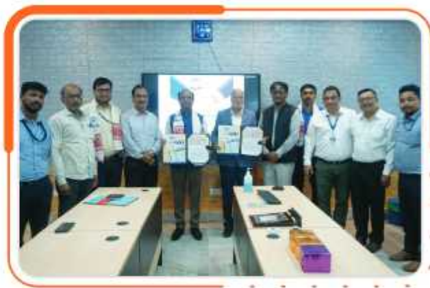
with ICAR, NRCP