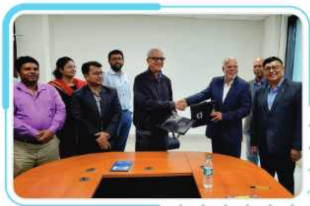
with IIIT Guwahati