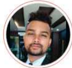
Ankil Kr Sing Srva Education