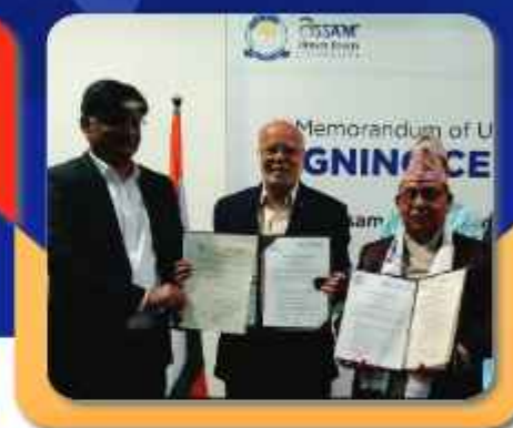
with Pokhara University